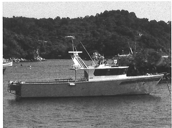
Wildfire on her mooring.