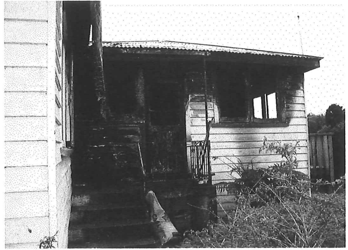
The badly charred door of the Nunnery