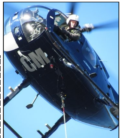
Zane transporting gear to Table Hill.