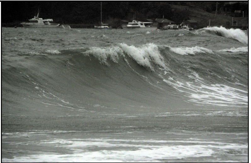
Big surf at Butterfield Beach.

Anyway it's not all same-old same-old, it would take a Neptune-sized miracle to reproduce May 2009 which