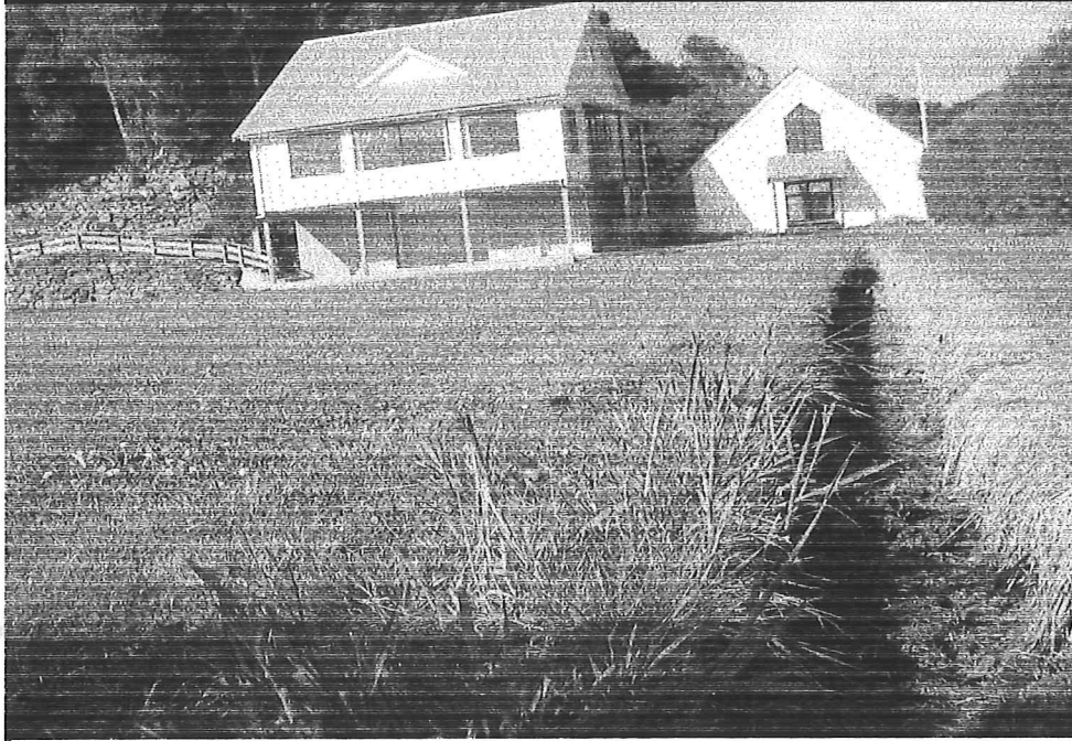
Worm's-eye view of current Halfmoon Bay bowling green.