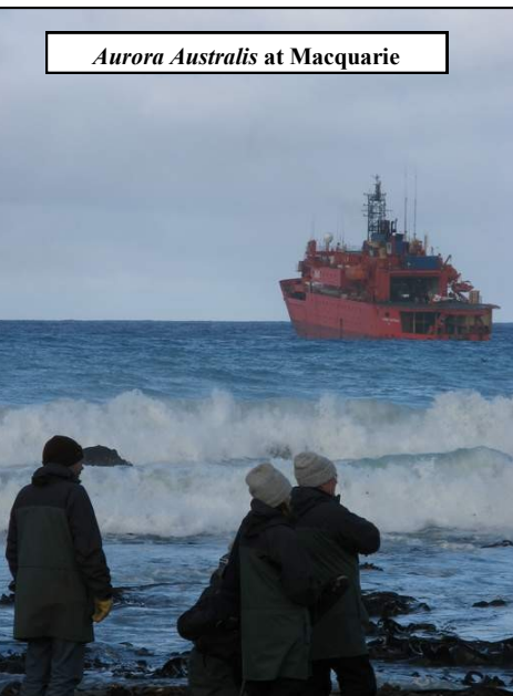
Aurora Australis at Macquarie