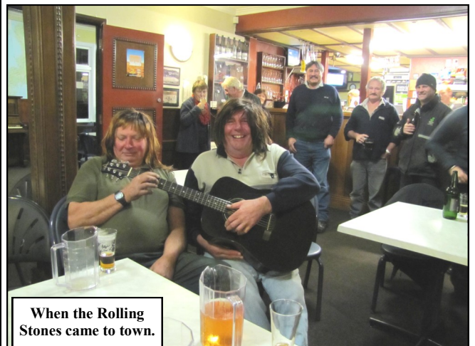
When the Rolling Stones came to town.