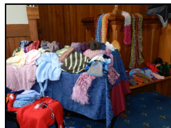
Photo shows some of the collection displayed at Oban Presbyterian Church which donated $100 towards the buying of wool.

So far beanies have been delivered to all the children in twelve primary schools and twenty-two pre-schools. Baby clothes will go to the neo-natal unit and to Plunket and slippers, scarves and other garments to some of the support hubs. Knitting has come from all over New Zealand and our distributor was delighted to be able to add Stewart Island to their map dotted with donation stars.