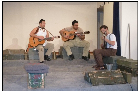
Thanks to Toi Rakiura for bringing another stellar theatrical performance to the Island stage. The audience loved the guys of Strange Resting Places .