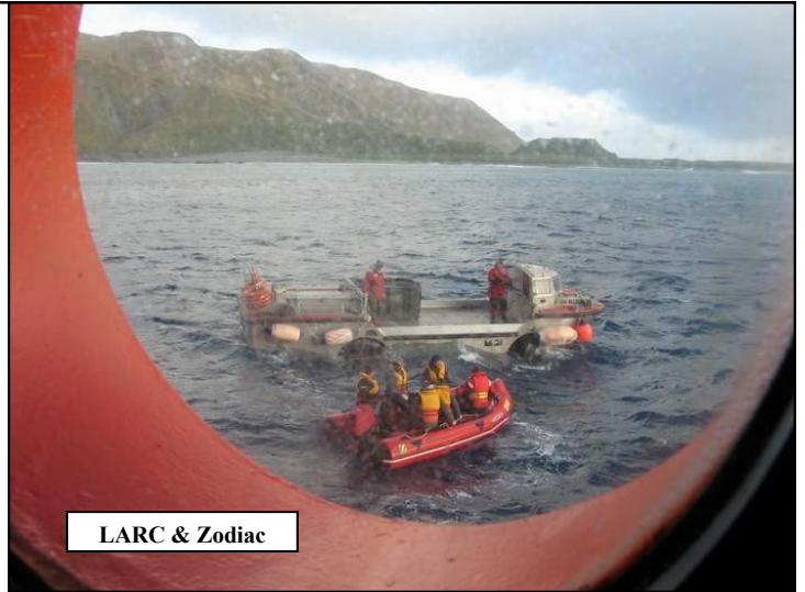
LARC & Zodiac

While we were doing this everyone else was busy with the resupply and changeover. The 4 helicopters which had been de-bladed and packed head to tail like sardines in the ship's hangar, were brought out, bladed up and began the process of flying pods of bait and other cargo ashore whenever weather was suitable. In-coming station crew and their belongings were brought ashore so they could have some overlap with their out-going