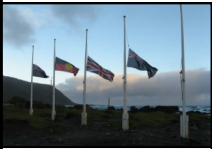
Flags at half-mast, ANZAC Day

Entertainment was "limited" to watching DVD's, reading, playing board or card games, enjoying the southern ocean views from the bridge, chatting with fellow passengers, and in my case – dog walking. I was one of 6 dog handlers on the voyage, responsible for the welfare of the 12 dogs which had to be fed, exercised, toileted, trained and groomed each day. The helideck at stern provided the perfect exercise / training / toileting area and