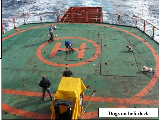
Dogs on heli-deck

In April I went to Macquarie Island on the Aurora Australis . Not the familiar pale grey, 4am reminder of the cray season underway (if you live within ear-shot of the Bay); this was a different Aurora Australis and the similarity stops with the name. The vessel I was on is a fire engine red/orange, 94.9m, 3911 tonne ice breaker owned by P&O Polar and on hire to the Australian Antarctic Division (the AAD) for shiploads of cash