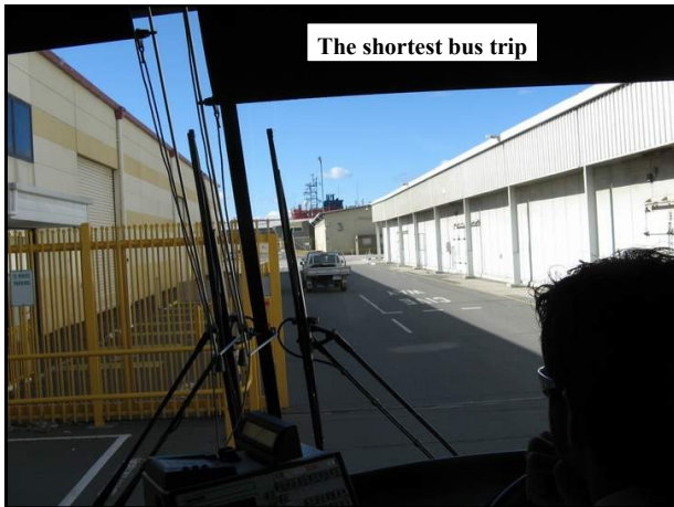
The shortest bus trip

dogs were housed in crates in one of the laboratories below. They were taken out several times each day, as much as the weather and sea conditions allowed, and put through their paces under the watchful eyes of two trainers who accompanied us. The dogs have been trained to indicate rabbits or rabbit sign and will have a key role to play in the rabbit eradication part of MIPEP once the aerial baiting has been completed. They and two of