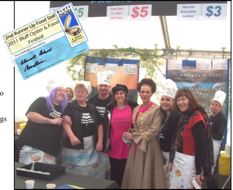
As usual, Islanders represented us proud at the Bluff Oyster Festival.

Thanks everyone who supported our special March issue Fund-raiser. The Stewart Island News sent the month's takings—$1,232—to the Red Cross Earthquake drive. The latest swarm of shocks have been deeply upsetting to many anxious and exhausted Cantabrians. To our ChCh family and neighbours: our doors are always open; come down here and de-stress for a while.