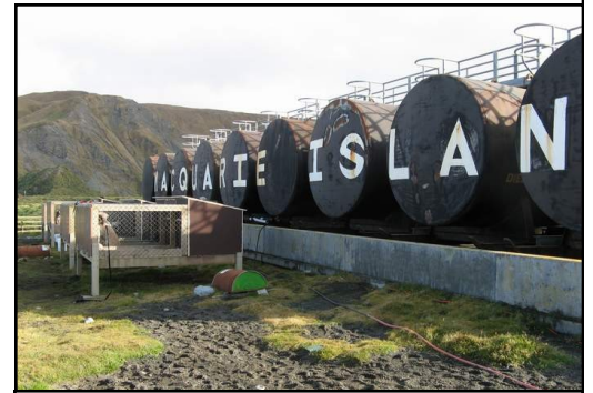
Fuel farm & dog kennels

helicopters, 12 dogs and around 300 tonnes of poison bait containing brodifacoum (the same stuff that is being proposed for use on Ulva Island) so that the Macquarie Island Pest Eradication Project (MIPEP) could begin.