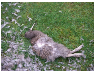
Traill Park 2007