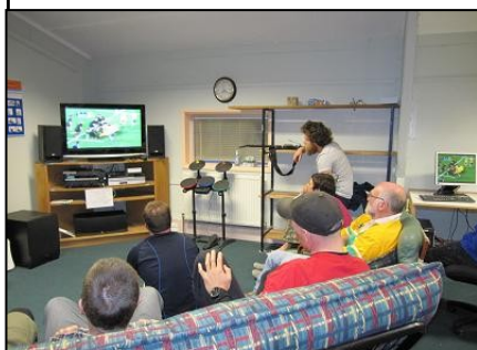
Watching the RWC

makes a big difference to the population on base and provides an excuse for "special occasions" and activities. The recent Rugby World Cup was keenly followed here; being an Australian territory most of the staff are Aussies, but