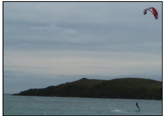
Kite surfing at Lee Bay