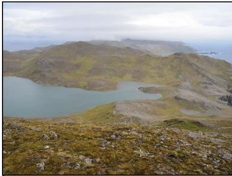
Looking south from Mt Waite (389m ASL)

Life as a rabbit hunter on subantarctic Macquarie Island has settled into a routine of 4 weeks field work followed by 4 days R&R back at base. Being settled into a routine might sound a bit dull, but there is always plenty happening both in the field and on base so time seems to be rocketing by. The total number of rabbits caught following last winter's eradication now stands at 13, and the team is on the trail of at least two more. Hopefully it is only a matter of time before they are caught. Thirteen rabbits might not sound like much of a result from four months of hunting, but it reflects the success of the aerial baiting, showing that the kill rate was very high. A lot of effort has gone into those 13 rabbits, with anything from 2,000 - 4,000km walked every month by the team of hunters, and probably three times that by the dogs. The effort will need to continue for a long time yet to ensure that every last rabbit is accounted for. Already we've found one litter, showing that some breeding has occurred since the baiting and it is crucial that the hunting pressure is kept up so that