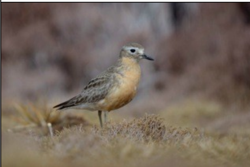
A Southern NZ Dotterel