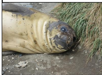
Moulting elephant seal

Crowded harems of females with young pups are tended by big beach master males constantly needing to defend their mating rights from smaller wannabe males. There are some ferocious and bloody battles, and sometimes the challenger wins.