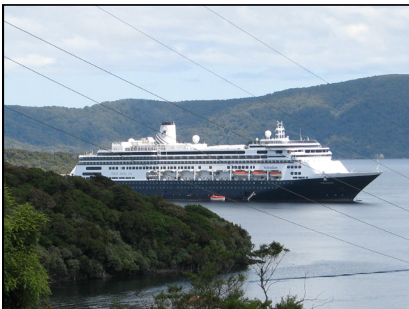
Above: Volendam visits the island.

OOPS...THEY DID IT AGAIN. Stewart Island Players would like to thank all those who sang, acted, sat, played, drank and partied at the December community concert. As a result, $850.00 was raised for the Stewart Island Health Committee. Well done!