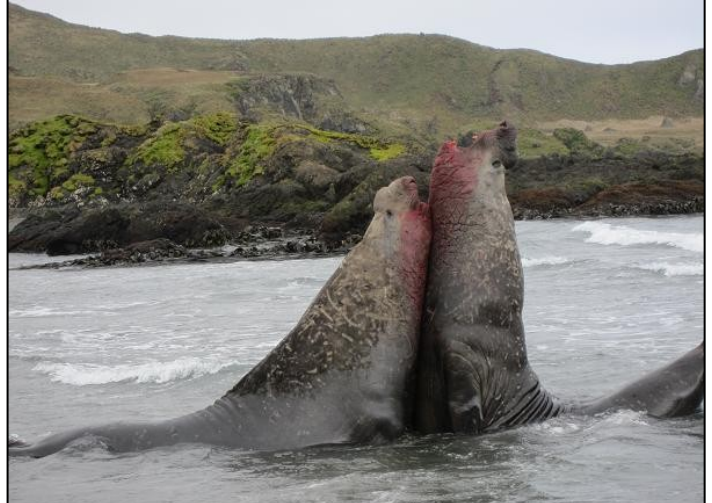
Two male elephant seals battle it out. The challenger, on the right, won.

Southern elephant seals have all but completed their breeding season, which began in August with the return of the large males (3-4 tonnes of blubber and bone!). The females began arriving in September to give birth to their pups which they suckle for only 3-4 weeks. During