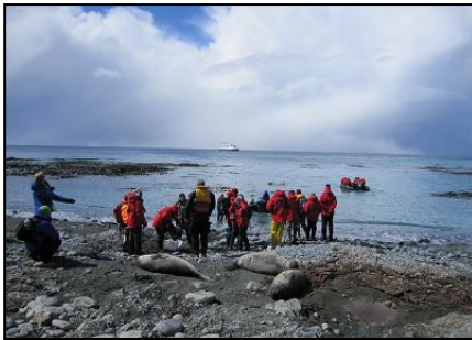
Tourists invade the beaches

There are 4 species of penguin here (almost my favourite birds) and they too are in