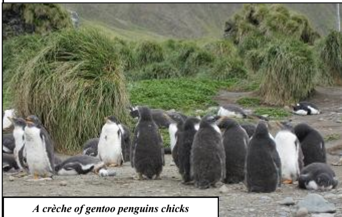
A crèche of gentoo penguins chicks

Gentoo penguins have quite large chicks which are running around out of their nests and forming crèches where the chicks hang out while their parents are out foraging. They are