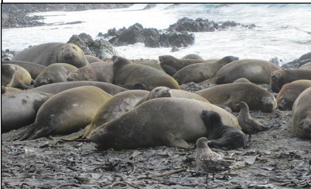
Elephant seal harem

giving birth, and abandon their pups to return to sea after about 4 weeks. The pups are then known as weaners and are left to fend for themselves. A few weeks ago the area around the base was littered with weaners lying around and trying to keep out of the way of the males. Now, early December, almost all of the females have disappeared as have most of the big males. Some of the latter die as a result of their exertions, providing a huge smelly feast for scavenging giant petrels and skuas. Immature animals have come ashore and started to