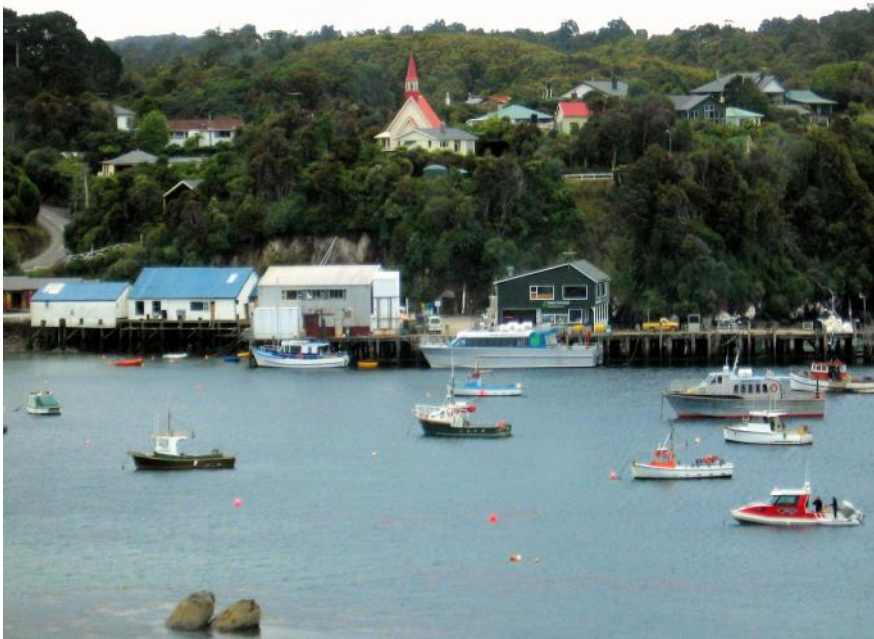
Halfmoon Bay a hive of activity with Oban Presbyterian Church on the hill.

The clocks have “fallen back” and some autumn leaves are showing themselves. Time to clean out the chimneys for the flicker of fires that are oh so cozy with the snap, crackle and pop of the dry wood. The change of season often brings more settled weather and beautiful lighting all around the island. There's a lovely verse in Ecclesiastes 3:1 that says, “to every thing there is a season and a time to every purpose under the heaven.” Now might be the time to start that project you were thinking about, taking some “me” time, planting something new in the garden, etc. Whatever it is do it with a purpose and thinking of others. You'll be amazed at the results.