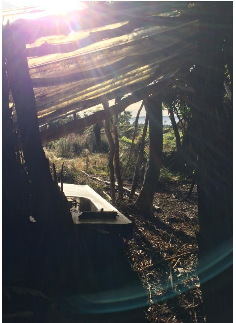
Every other Friday, the biggest kids at Rugrats and the littlest kids at the school attend Bush School, where they learn outdoor skills through good old fashioned muddy play. Their village of ponga huts are remarkable and I particularly like this one which used recycled old house materials. Got to love the sea view, sunroof, and kitchen sink!

Please visit www.southernruralfire.org.nz for additional information.