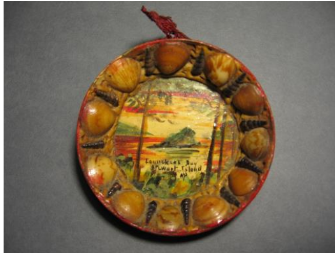
Mab Prentice's painting of Lonnekers Beach

Well, it has been a busy last month at the museum with the Lockerbie Collection arriving and many inquiries ranging from Island families to tram line tracks. We invite all locals to come up and see the collection. Bev and I are here from 9:30 - 12 noon Monday to Friday but feel free to phone us if you'd like to come and see it at a later time or in the evening.